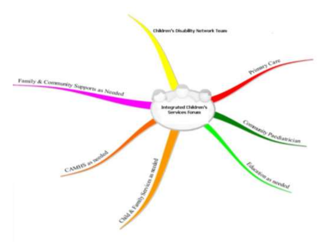
Diagram: Integrated Childrens Services Forum

The local Integrated Children's Services Forum is a meeting of relevant services and disciplines across the Healthcare Divisions i.e. Primary Care, Social Care and Mental Health and across relevant Hospital Services and other Agencies/Departments such as TUSLA the Child and Family Agency, Education and other, which provides a mechanism for deciding where the child or young person's needs will be best met at any particular time, where it is unclear as to the pathway for a child or young person to receive service(s).